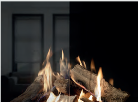
Clear View (anti-reflective) glass

Replicates the appearance of a real, open fire.