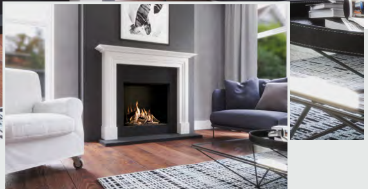
Option with black interior