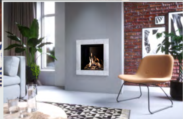
Hole-in wall solution with optional frame and black interior